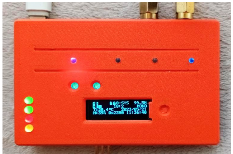
Illustration 3: MD overview