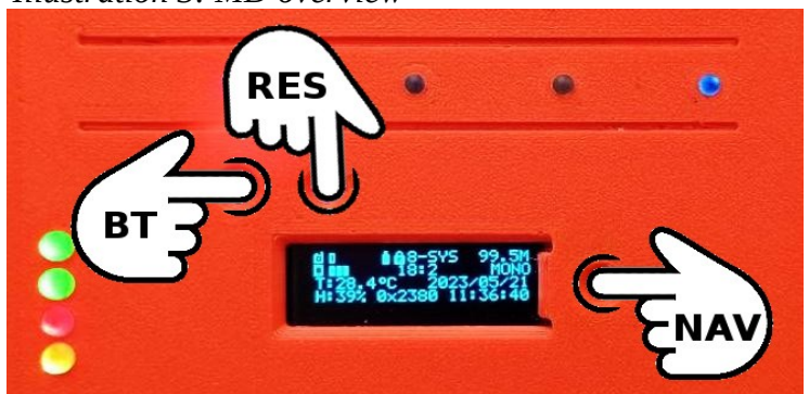
Illustration 4: Buttons