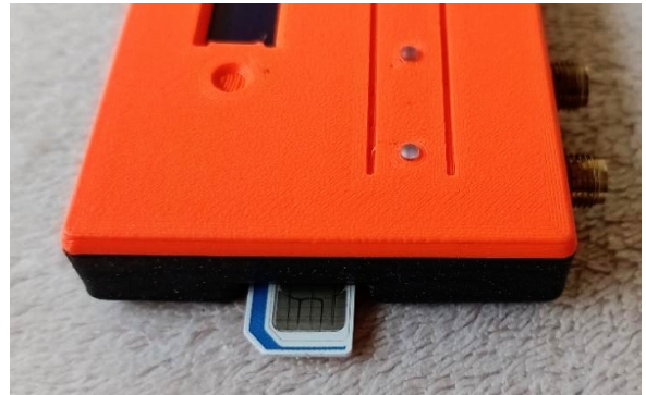
Illustration 1: SIM card slot